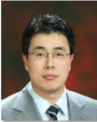
Date of Birth 1973.9.7